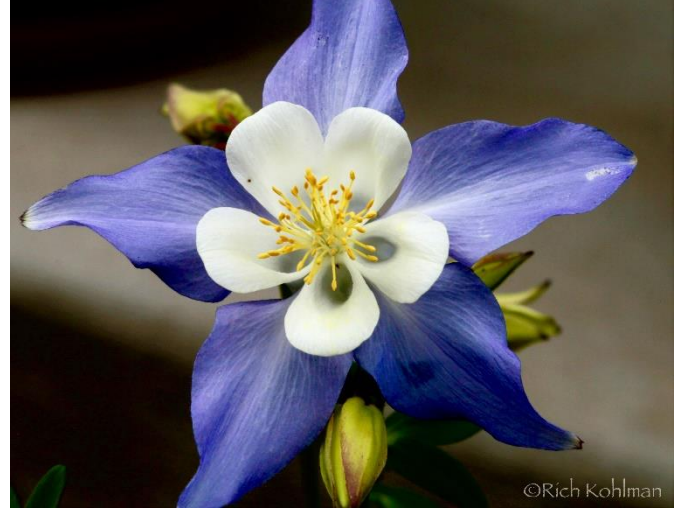
Not Everything Is Canceled

Sunshine is not canceled Spring is not canceled Love is not canceled Relationships are not canceled Reading is not canceled Naps are not canceled Devotion is not canceled Music is not canceled Imagination is not canceled Kindness is not canceled Conversations are not canceled Humor is not canceled Hope is not canceled