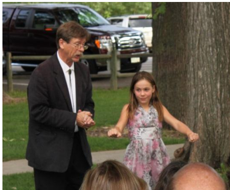
There is no red ball in my hand!