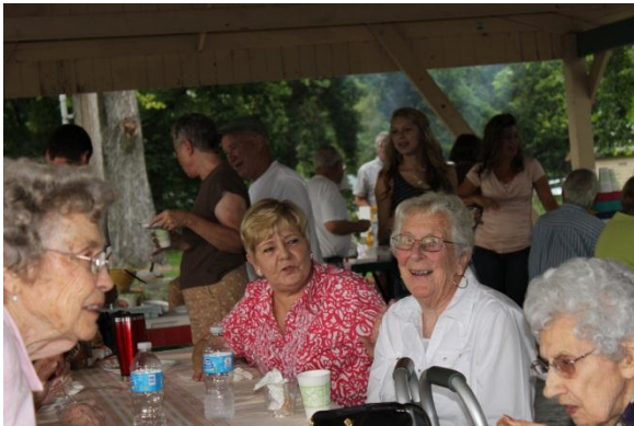
Food and fun for everyone!