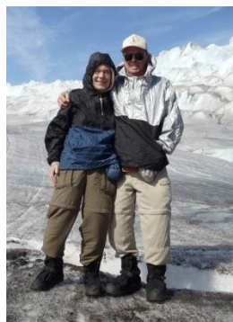
On Mendenhall Glacier near Juneau, Alaska