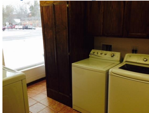
Two new washers and dryers