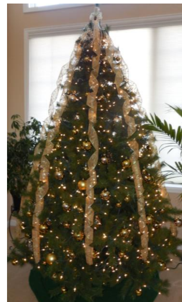
Two Christmas trees at Miners' house—one in the family room and a gold one in the front window!