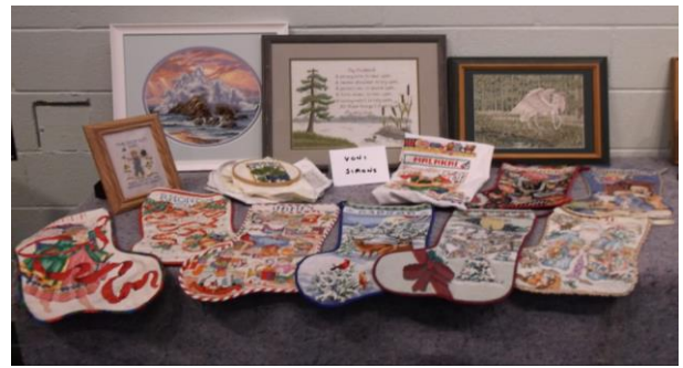
Voni Simons's needlework