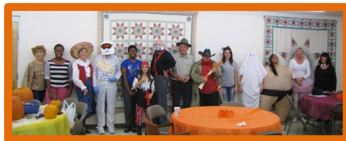
Great costumes at our 2014 Harvest Party.