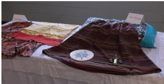
Shuri and Nanga Chungag's summer sewing projects