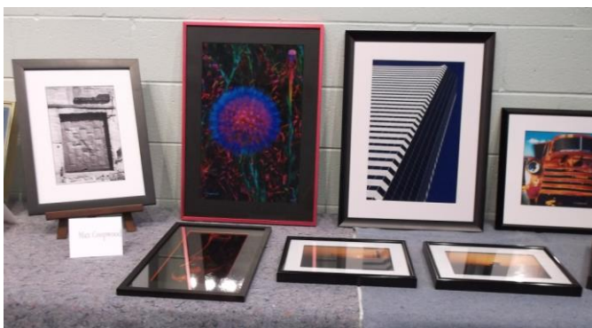
Max Coopwood's photographs