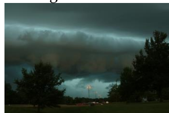
Storm rolling in Sunday morning