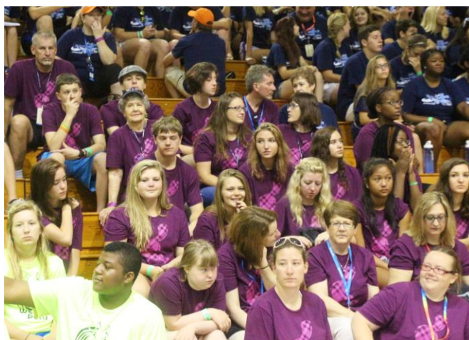
At morning Celebration