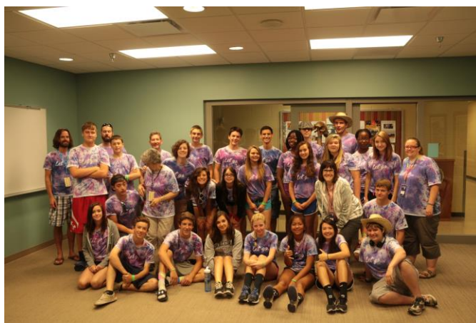
The Rocky Mountain delegation