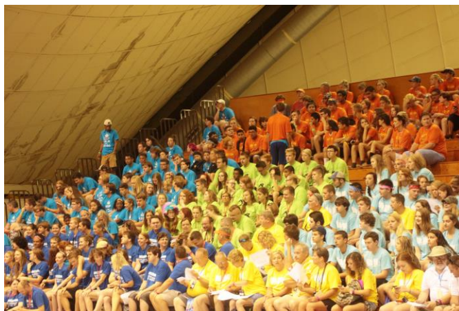
Other delegations at Celebration