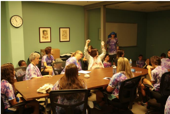
Delegation meeting to plan the day