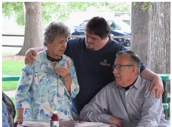
When I grow up I want to be just like you two.