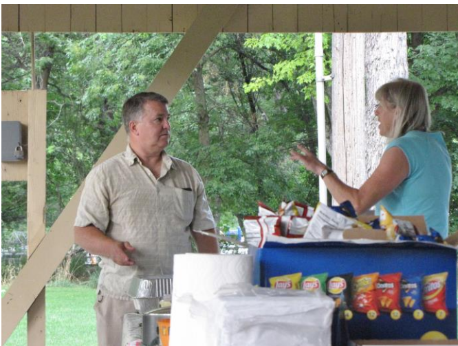
I said I didn't want mustard!!!