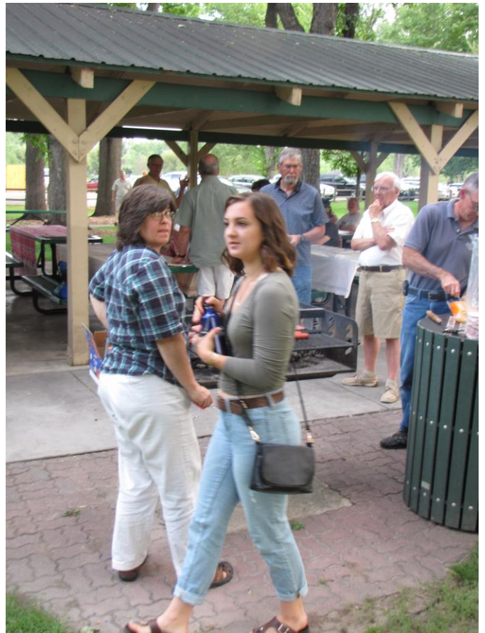
Just waiting for the fun to start.