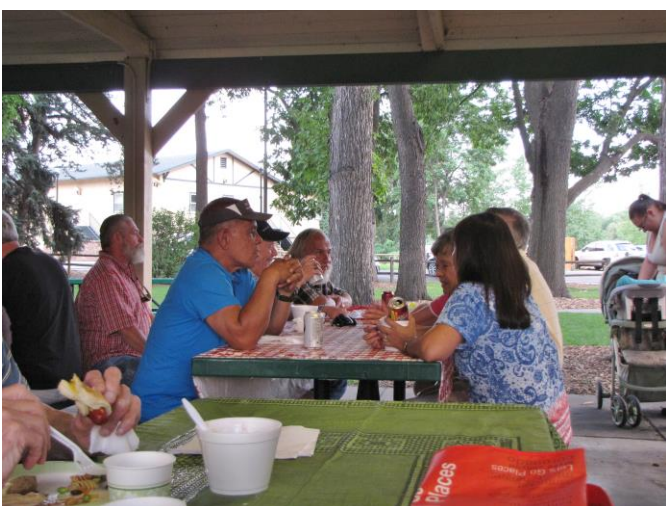
Great food. Great fellowship.