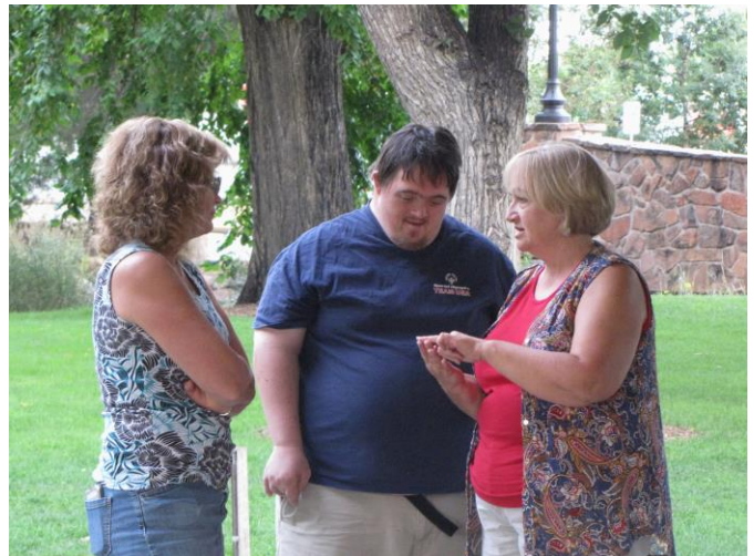
We're going to Graceland (the Memphis one in September).