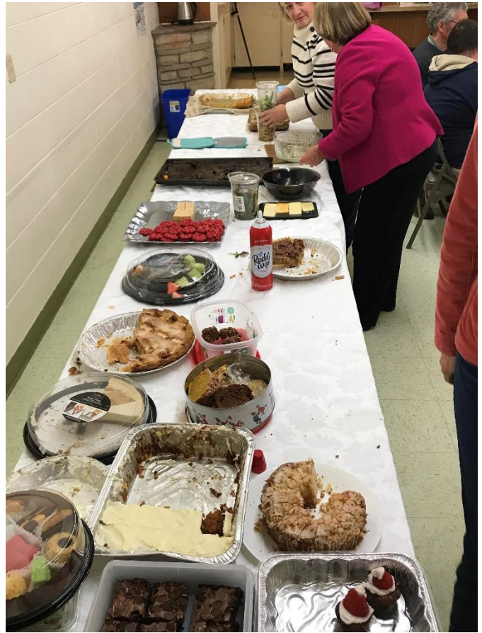
We licked the platters almost clean!