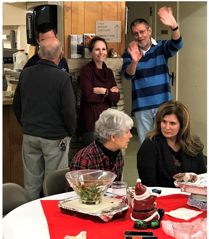
Good conversation with good friends!