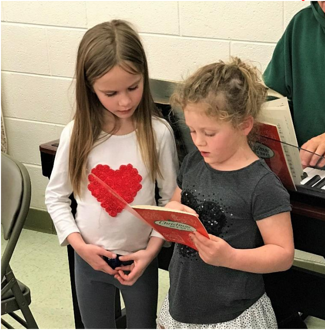
Angels from the realms of glory!